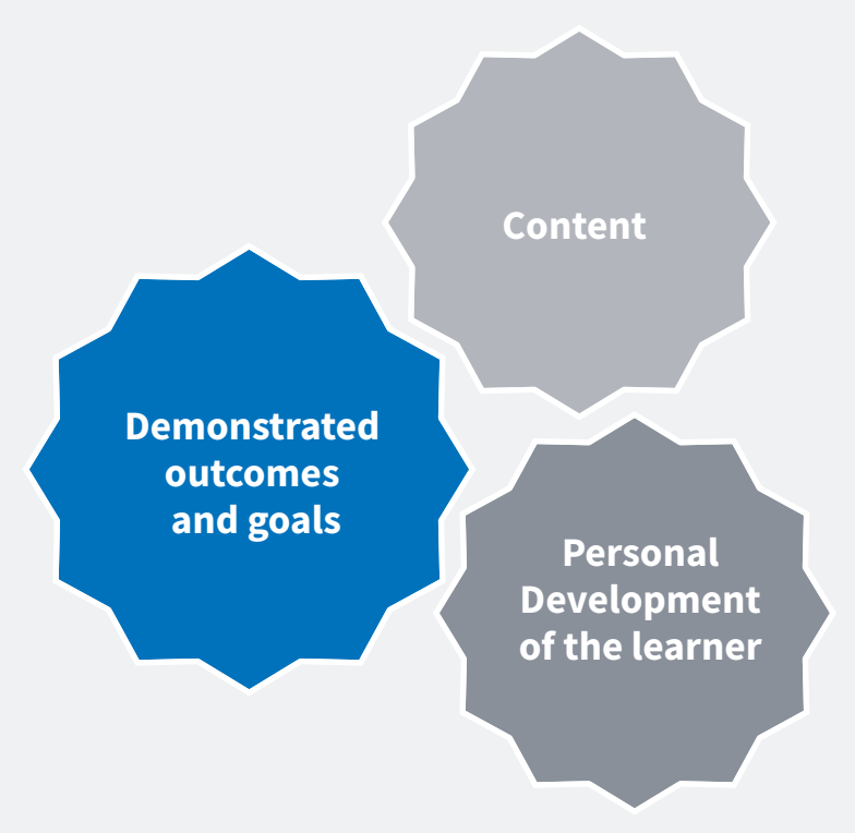
Figure 1: Learning in self-assessment: A dynamic relationship exists between content, demonstrated outcomes and goals and the personal development of the learner. Within self-assessment, it is the learner who decides, as the need arises, which 'cog' is emphasised (adapted from Taras, 2010).

For self-assessment to be effective, students should first become familiar with the concept. The term 'self-assessment' is used to cover all judgements by learners of their work: it is related to and incorporates terms such as 'self-evaluation' and 'self-appraisal'. There are several different purposes of self-assessment: to evaluate understanding of the content, to demonstrate the achievement of outcomes and goals and the self-development of the learner (Figure 1). These three aspects of self-assessment are all inter-linked and will receive different emphases at different times during the process of learning.